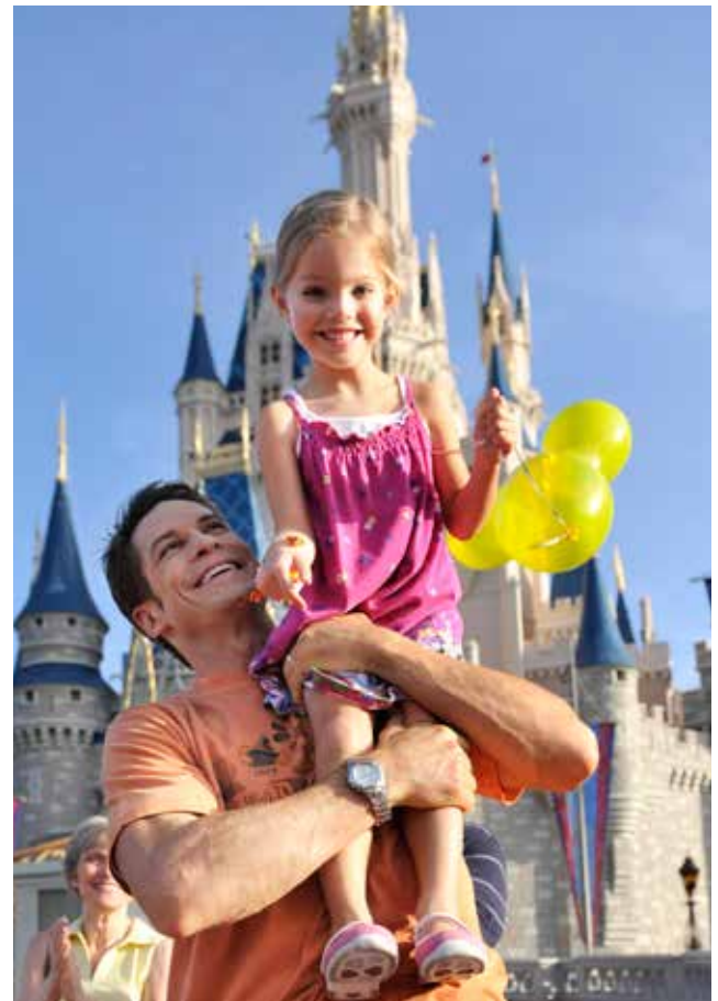
As to Disney properties/artwork: © Disney.

Nemours/Alfred I. duPont Hospital for Children Attn: Office of Continuing Medical Education PO Box 269, Wilmington, DE 19899