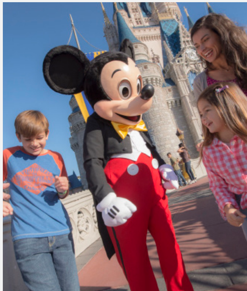
As to Disney properties/artwork: © Disney.