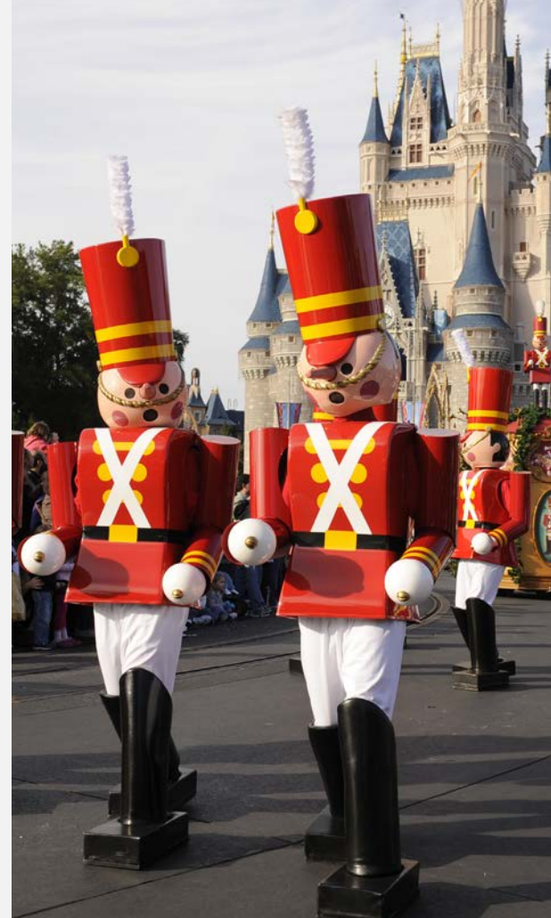
As to Disney properties/artwork. © Disney.

We hope that you will be able to join us for Hot Topics in Pediatrics !